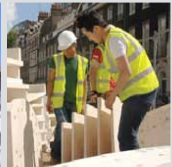
The Architectural Association Pavilion 'Swoosh' (2009).

A collaboration of the Architectural Association 3rd year students with Finnforest - Timber Company and ARUP engineers