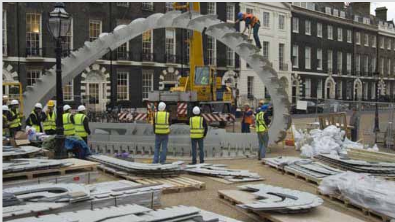
Left :The Architectural Association Pavilion 'Driftwood' (2008) - A collaboration of the Architectural Association 2nd year students with Finnforest and ARUP engineers.