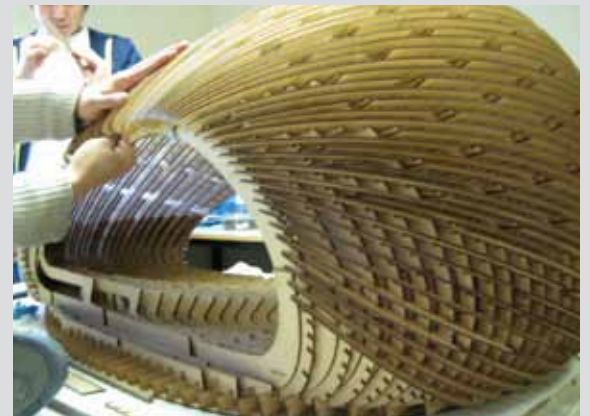
The Architectural Association Pavilion 'TEN' (2007). A collaboration of the Architectural Association graduate school students with Fiber C / Reider - Fiber concrete company and AKT Engineers [UK]