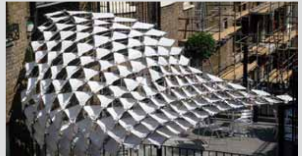
Right: The Architectural Association Membrane Canopy (2007) - A collaboration of the Architectural Association Emtech students with Buro Happold Consulting Engineers.